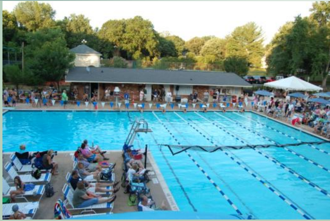
A Home Swim Meet at Windyrush

1st Annual Firecracker 5k & Family Fun Run on July 3— details on page 7!