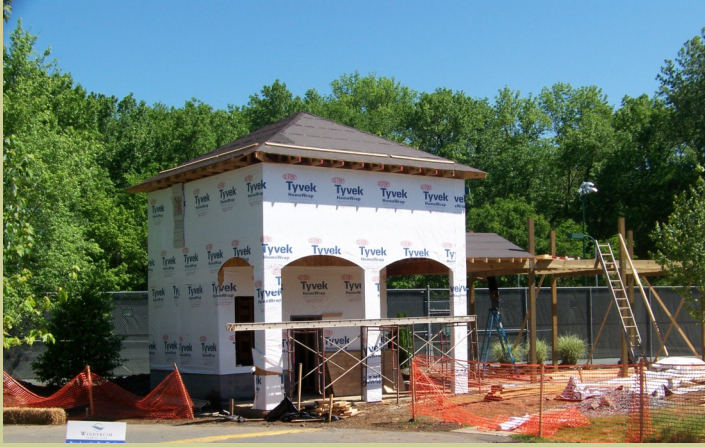
The tennis pavilion under construction

Swim & Dive Team Practice Begins May 18.